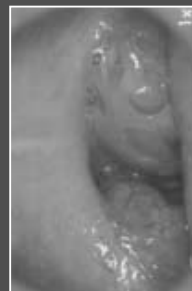
The removal of enlarged tonsils like this can relieve airway obstruction.

We only take them out if they are doing more harm than good. We take tonsils out if they cause recurrent sore throats despite treatment with antibiotics. The other main reason for removing tonsils is if they are large and block the airway. A quinsy is an abscess that develops alongside the tonsil, as a result of tonsil infection, and is most unpleasant. People who have had a quinsy therefore often choose to have a tonsillectomy to prevent having another. Tonsils are also removed if we suspect there is a tumour in the tonsil. A rapid increase in the size of a tonsil or ulceration or bleeding occurs if a tumour of the tonsil develops. Tumours of the tonsil are rare.